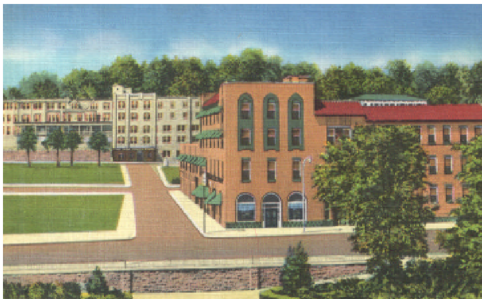
Castle Rock Hotel, 120 E. Bluff, pictured at left. Building at right is the Ball Clinic building. Both are demolished.